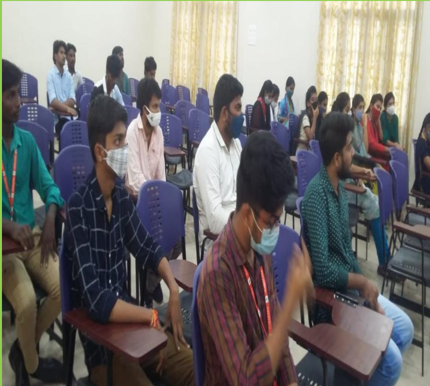
Students during event